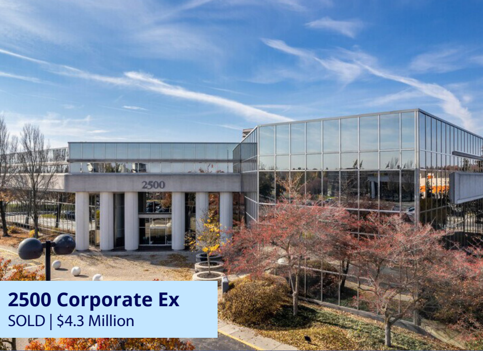
2500 Corporate Ex SOLD | $4.3 Million