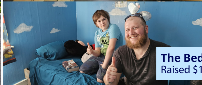
The Bed Brigade Raised $16k+