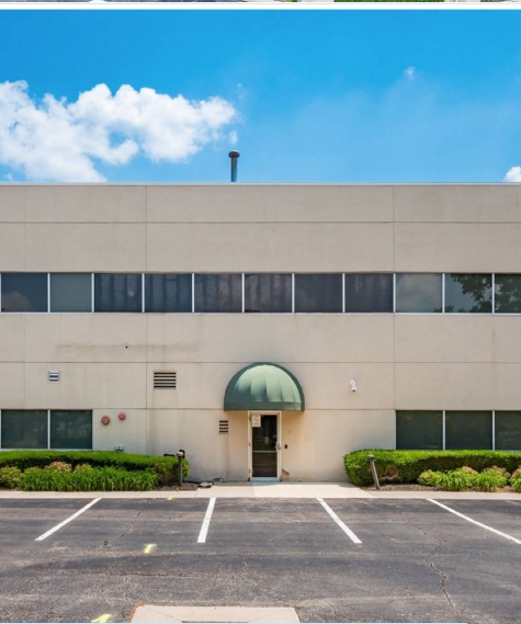
325 Cramer Creek SOLD | $2.5 Million