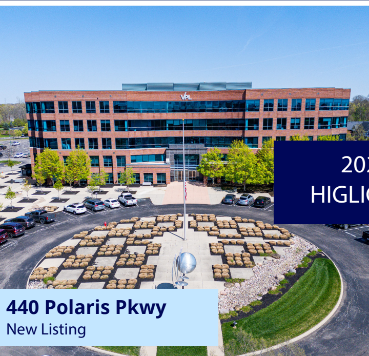
440 Polaris Pkwy New Listing