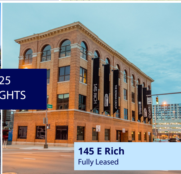
145 E Rich Fully Leased